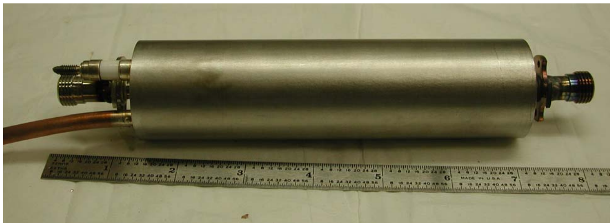
Photo of 9 inch, 248nm NeCu laser tube

In most cases a laser tube can be reprocessed at low cost when mirror contamination or buffer gas pressure lifetime limits are reached. This can typically be done more than 10 times before the ultimate bore erosion lifetime limit of a tube is reached. Reprocessing involves putting the